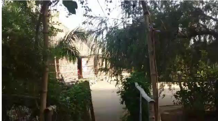
Solar Panels at Badeen